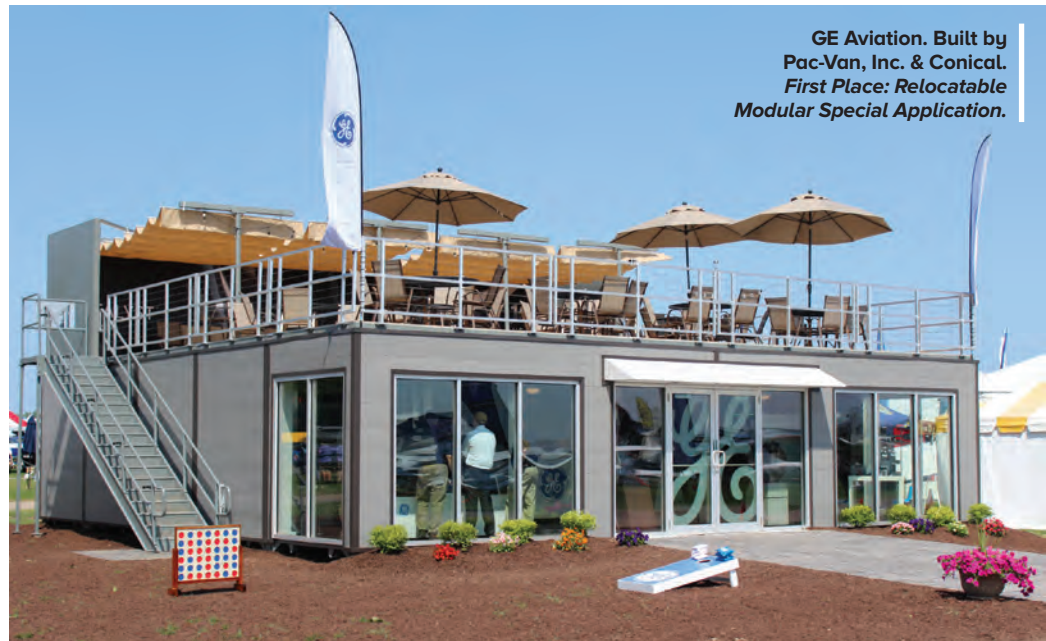
GE Aviation. Built by Pac-Van, Inc. & Conical. First Place: Relocatable Modular Special Application.

temporary space, and relocatability are important. Used as standard field offices, construction site and in-plant buildings are available for immediate delivery. Standard construction is wood, but steel units are available to meet noncombustible requirements. In-plant buildings are available as single- or two-story units for industrial environments with