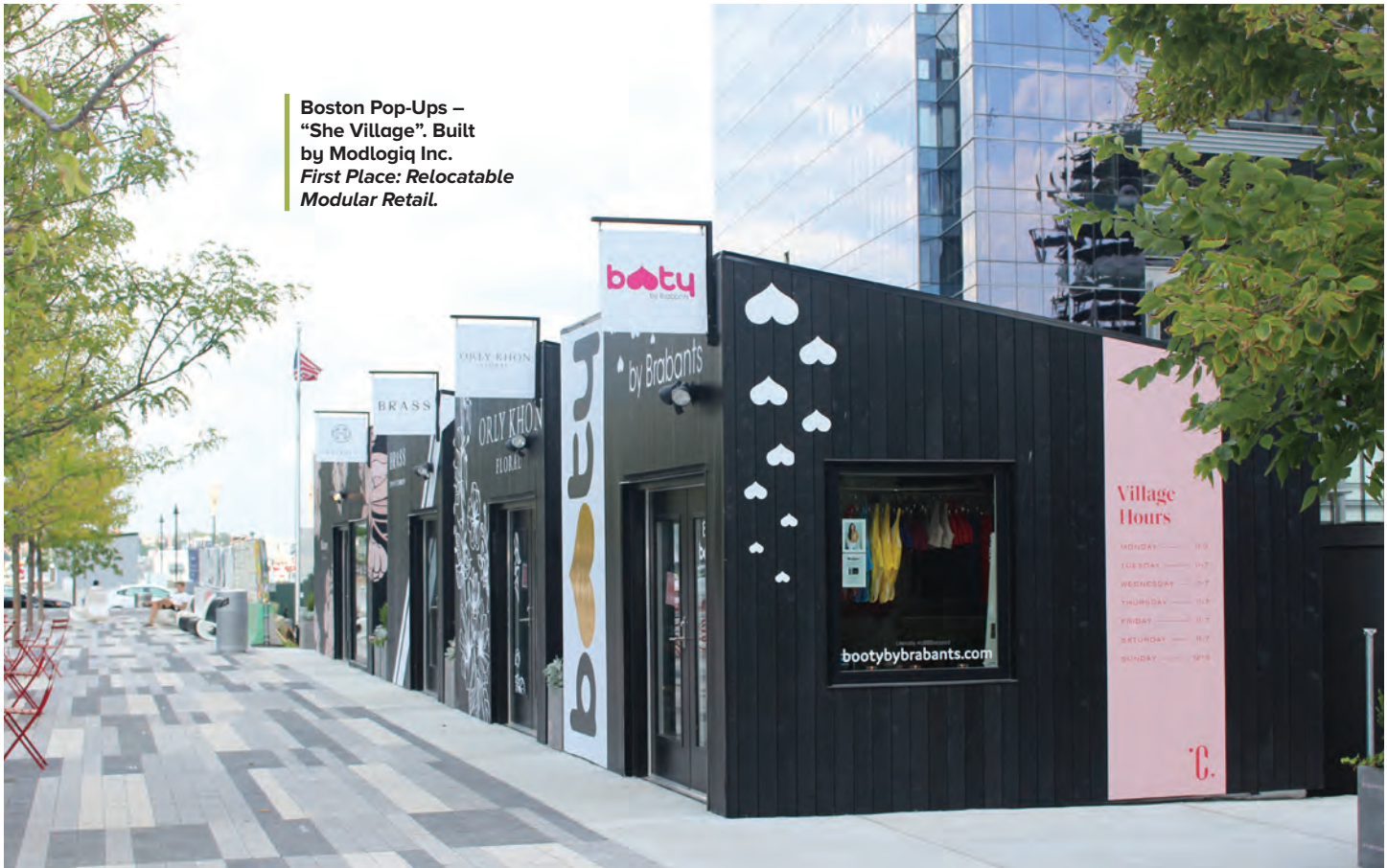
Boston Pop-Ups – “She Village”. Built by Modlogiq Inc. First Place: Relocatable Modular Retail.

noise-reducing insulation. They are typically moveable by forklift and include electrical and communications wiring, heating, air conditioning, and even plumbing.