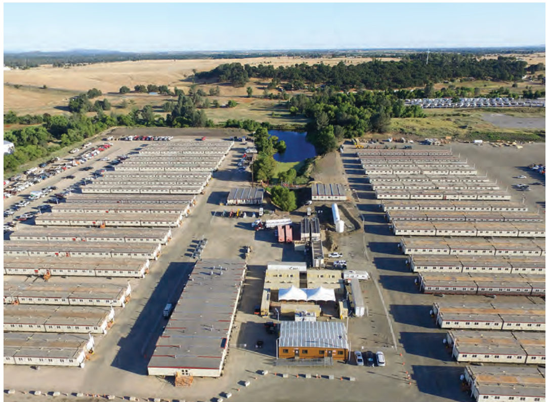
SPSG Camp Fire Lodge. Built by Black Diamond Group. First Place: Best Relocatable Modular Workforce Housing.

If the $20,000 unit and one of the $10,000 units are on lease, the utilization rate would be 66.7 percent (2 units/3 units) using the unit count method, but 75 percent ($30,000/$40,000) using the OEC method.