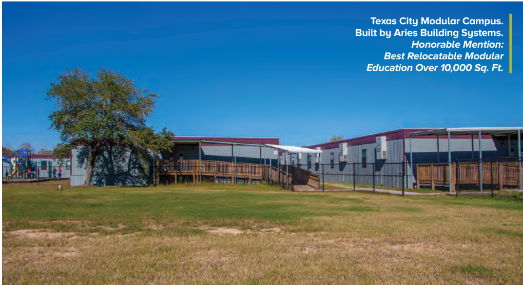
Texas City Modular Campus. Built by Aries Building Systems. Honorable Mention: Best Relocatable Modular Education Over 10,000 Sq. Ft.

that the average sale price to original cost ratio for 2019 was 1.52:1. This includes the sale of all types of units (single wides, double wides, complexes).