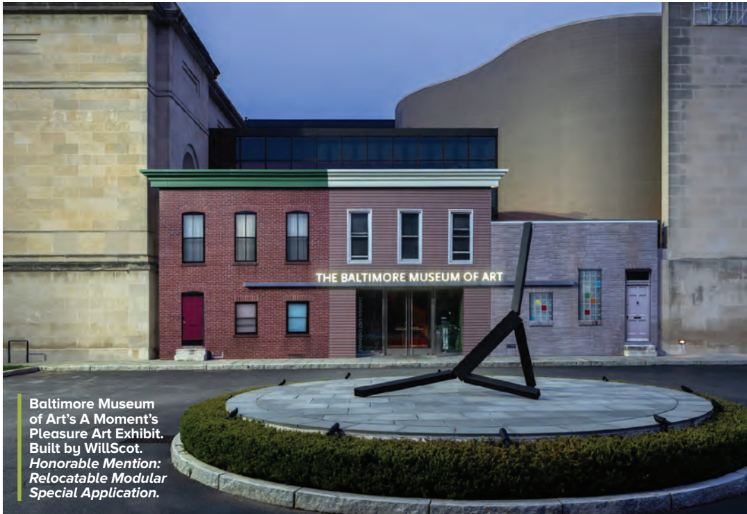
Baltimore Museum of Art’s A Moment’s Pleasure Art Exhibit. Built by WillScot. Honorable Mention: Relocatable Modular Special Application.

data set have a lease fleet larger than the mean. The median number of units from this data set was 1,581. The percent of units owned varies greatly by region as some of the larger players are more heavily concentrated in certain regions and less in other regions, while some