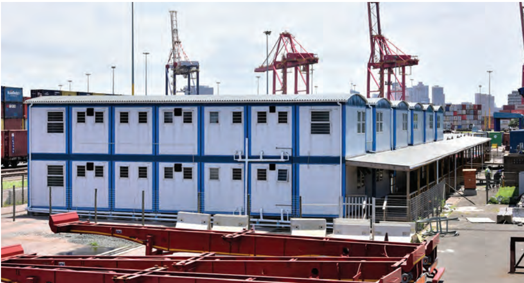
Transnet TPT - Durban Harbour. Built by Modular Site Solutions (Pty) Ltd. & Container Conversions (Pty) Ltd. First Place: Relocatable Modular Office Over 10,000 Sq. Ft.

Economical and convenient equipment and storage buildings offer onsite protection from inclement weather and theft. Day in and day out, relocatable buildings offer durability and strength. Equipment shelters for construction sites, chemical storage buildings, temporary generator housing, and other applications are designed and built by MBI members to guard a client's investment. These buildings can be as