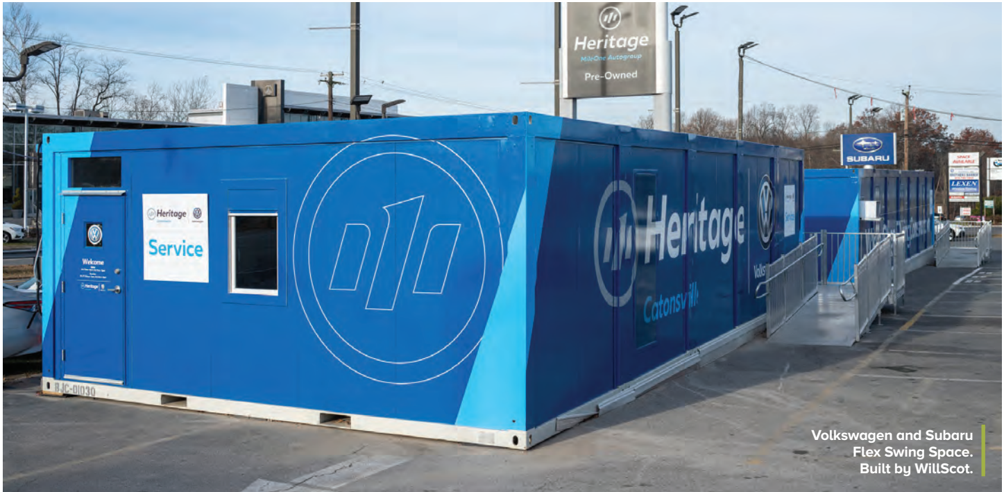
Volkswagen and Subaru Flex Swing Space. Built by WillScot.

the manufacturing of modular units, from hospitality-related services attributed to workforce housing accommodations (i.e., facility service and catering), and from construction projects such as multifamily housing developments. To the greatest extent possible, MBI separated and did not include revenue from construction projects or facility services for purposes of this report. This data focuses on the leasing and sales revenue