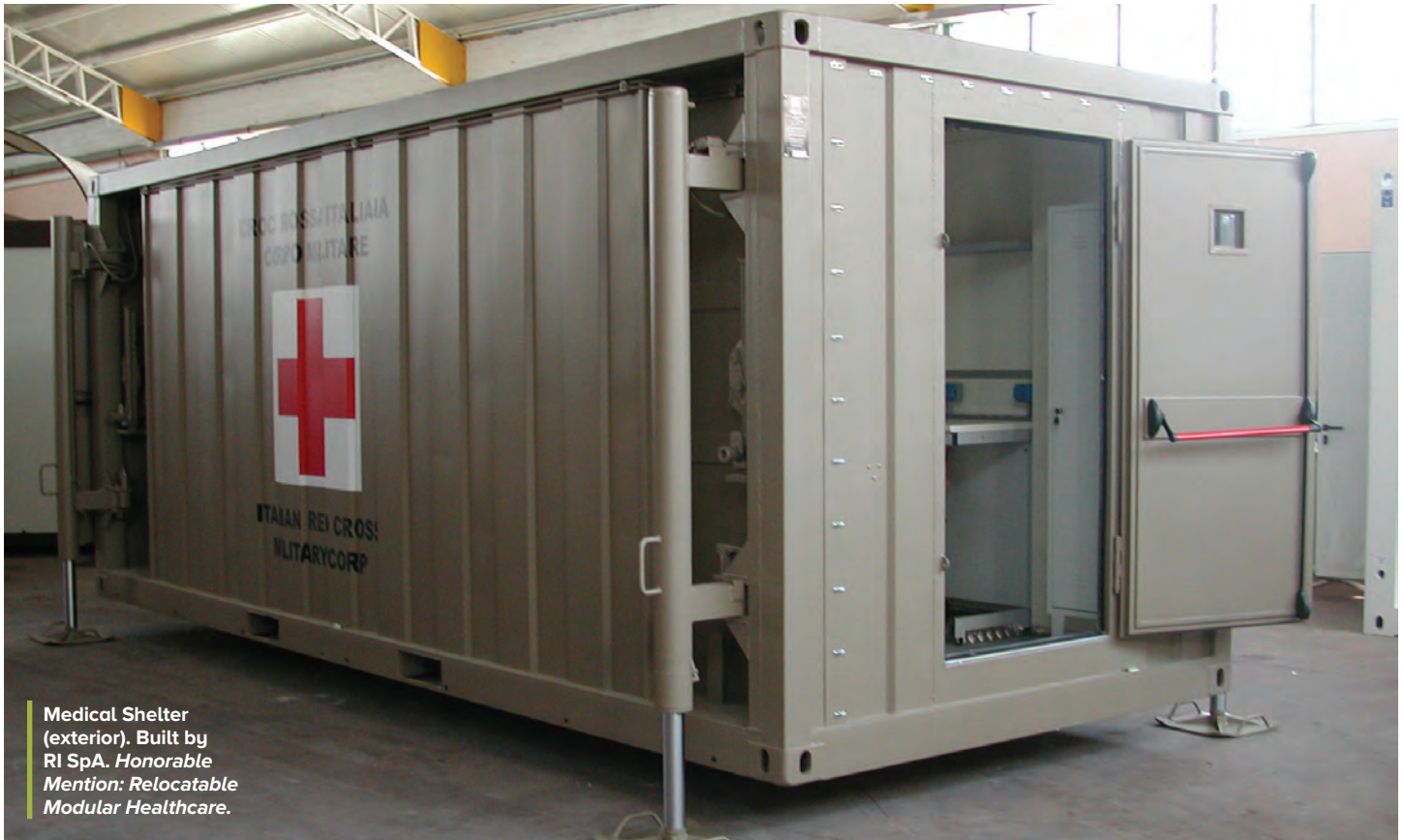
Medical Shelter (exterior). Built by RI SpA. Honorable Mention: Relocatable Modular Healthcare.

simple as steel containers to units that are heated and air conditioned with exteriors of brick, stone aggregate, or stucco.