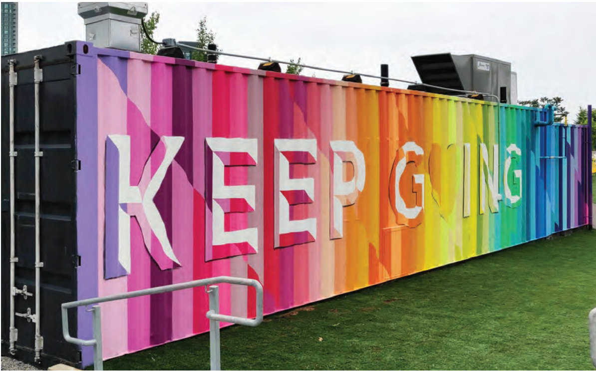
Stack Public Washroom. Built by Corner Cast Construction Inc. Honorable Mention: Relocatable Modular Single-Wide.