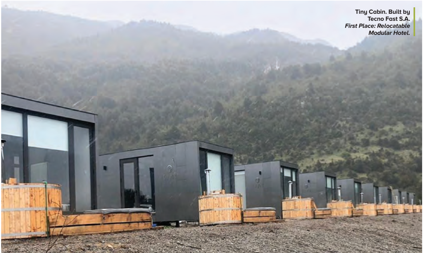
Tiny Cabin. Built by Tecno Fast S.A. First Place: Relocatable Modular Hotel.

MBI obtained revenue and fleet data from 25 companies engaged in the sale and lease of relocatable buildings in North America. This represents a majority of all companies in the market in terms of number of companies, revenue, and units owned.