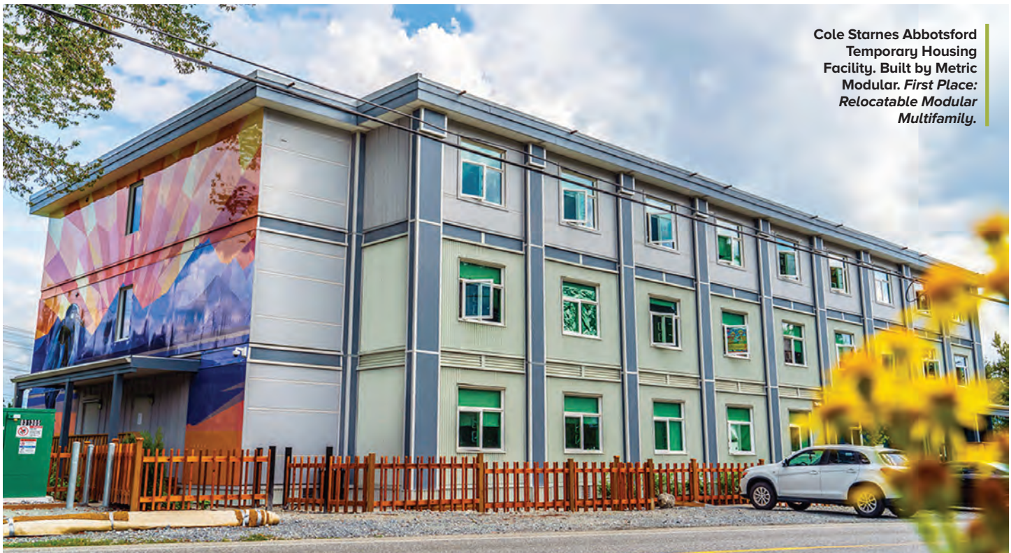
Cole Starnes Abbotsford Temporary Housing Facility. Built by Metric Modular. First Place: Relocatable Modular Multifamily.

average lease durations of 12 months or greater; return the original equipment cost through revenue within four years on average; and require lower maintenance costs than units used for the resource sector.