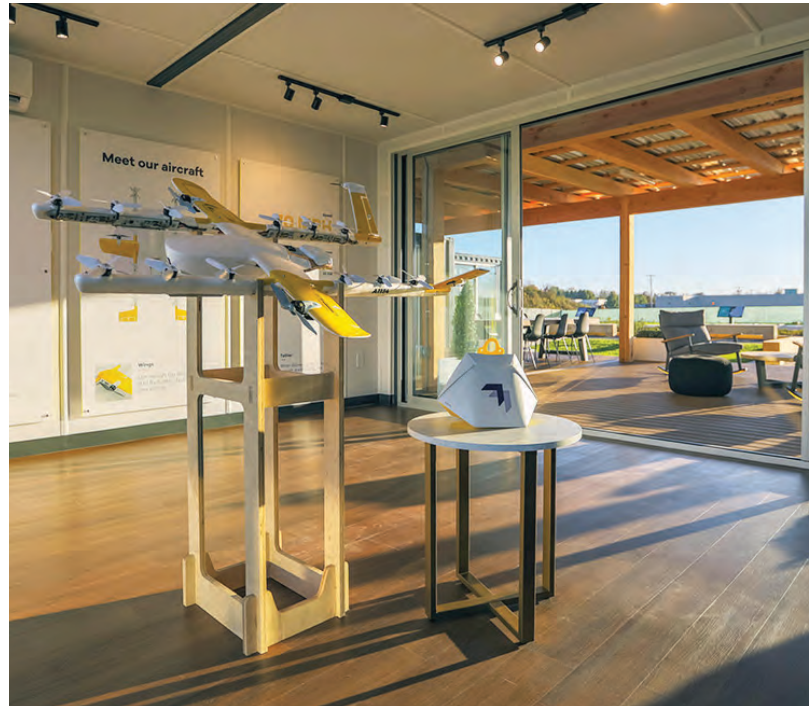
Wing Aviation, LLC - Christiansburg NEST (interior).

PMC is an innovative, sustainable construction delivery method utilizing offsite, lean manufacturing techniques to prefabricate single or multi-