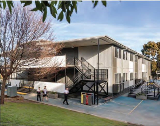
Carey Baptist Grammar M-Link Building (exterior). Built by FleetwoodBuilding Solutions. First Place: Relocatable Modular Education Over 10,000 Sq. Ft.

third-party is the indication for the local building code official that the unit does in fact comply with codes. The local official, therefore, generally has no jurisdiction over “what is inside the box.” However, local requirements affecting buildings, such as local land-use and zoning, local fire zones, site development, building setback, side and rear yard requirements, property line requirements, and subdivision regulations, are within the scope of the local authority.