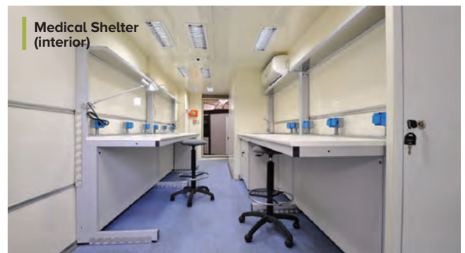
Medical Shelter (interior)

transitional shelter and basic community needs following natural disasters than relocatable buildings. Relocatable buildings can be quickly and efficiently deployed for emergency shelter, medical and educational needs, or to accommodate relief workers.