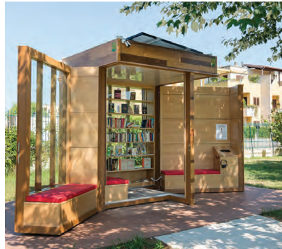
StoryBook Shelter (interior).

The relocatable building will also have a manufacturer’s data plate that is permanently attached on or adjacent to the electrical panel posted in the location as noted on the drawings, and includes information such as: